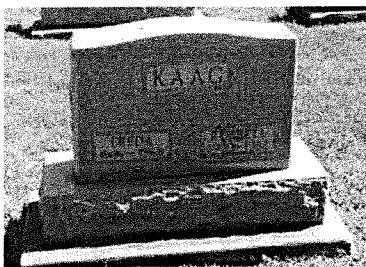
Added by RWCNAC